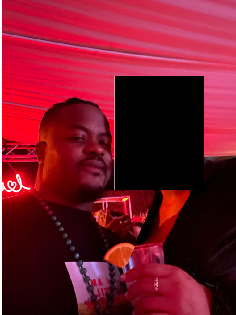
This photo was taken shortly before the shooting.