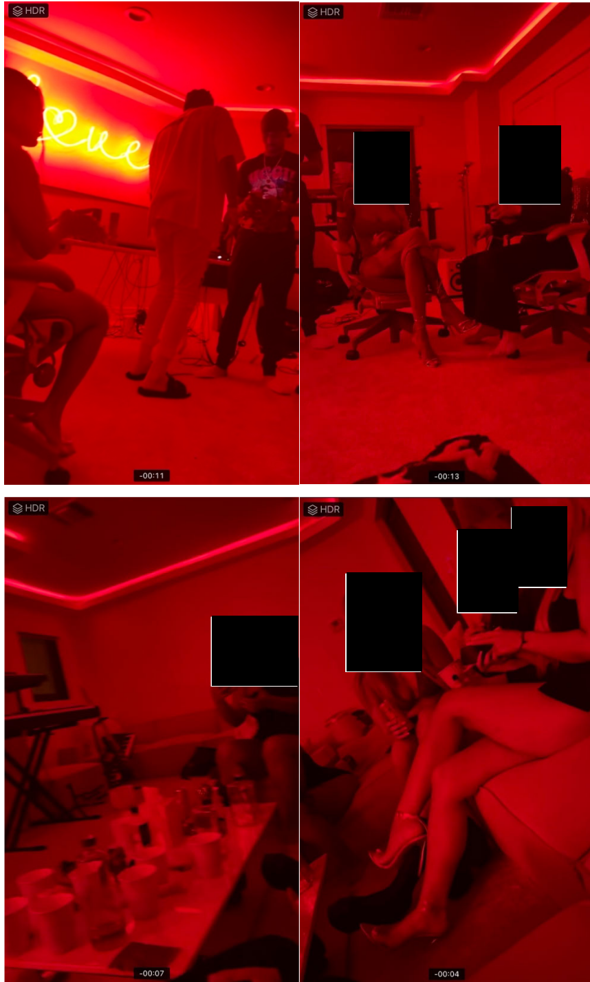
This Video Was Taken On January 29, 2023 Inside Sean Combs Home Located At 2 Star Island in Miami Florida